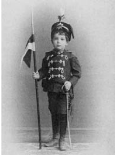
Walter Benjamin as a soldier, 1897.

to stove, the pop of the flame igniting in the gas mantle, the clacking of the lamp globe on its brass ring as a vehicle passes, the jingling of a key basket, the bells at the front and back staircases. In 'Loggias', he revealed how the throb of passing trams and the thud of carpet beating rocked him to sleep. For his first ten years Benjamin was formed in and by the rush of an imperial city, a mollusc constrained and protected by the city as it rapidly flung its energies into modernizing, with the introduction of new technologies of transportation and labour, leisure and war.