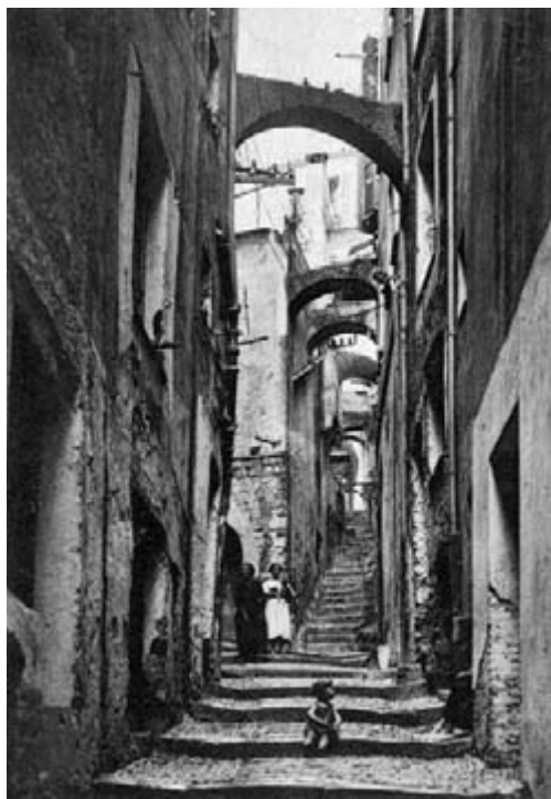
San Remo provided a refuge in the winter months of 1934/35.

In Germany Benjamin’s writings made their final pseudonymous appearances. On 6 December ‘On the Minute’ appeared in the Frankfurter Zeitung . In it, Benjamin recalled his first radio lecture. He had prepared and practised a twenty-minute text. The necessity of adhering rigidly to the allotted time could not have been more forcefully presented. He began to read in ‘this chamber designed for