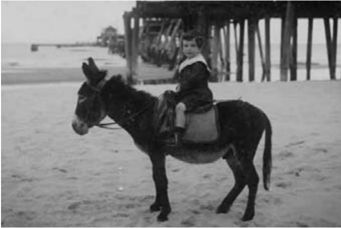
Walter Benjamin at Heringsdorf, 1896.