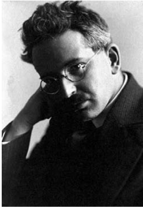
Walter Benjamin around 1929.