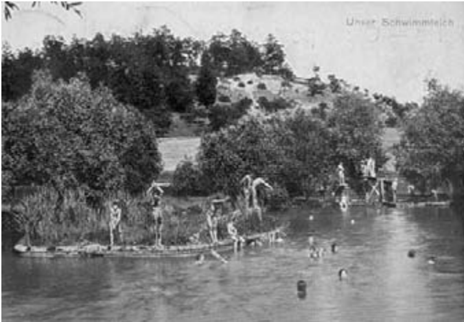
A postcard of nude swimming at the Thuringian progressive school that Walter Benjamin attended in 1905–6.