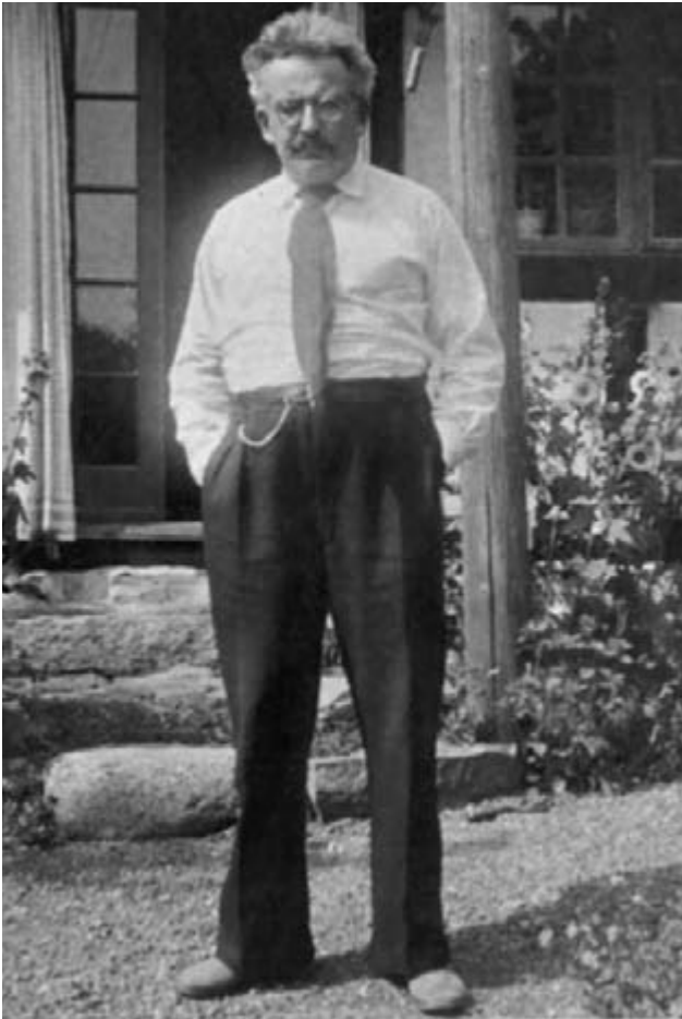
Walter Benjamin at Skovsbostrand in Denmark, 1938.

A letter to Theodor and Gretel Adorno on 19 June made several references to America, where the two had relocated. He tipped them off about a collection of primitive pictures by unknown artists from 1800–40, which stemmed mainly from the American Folk Art Gallery and had been shown in Europe. He recommended