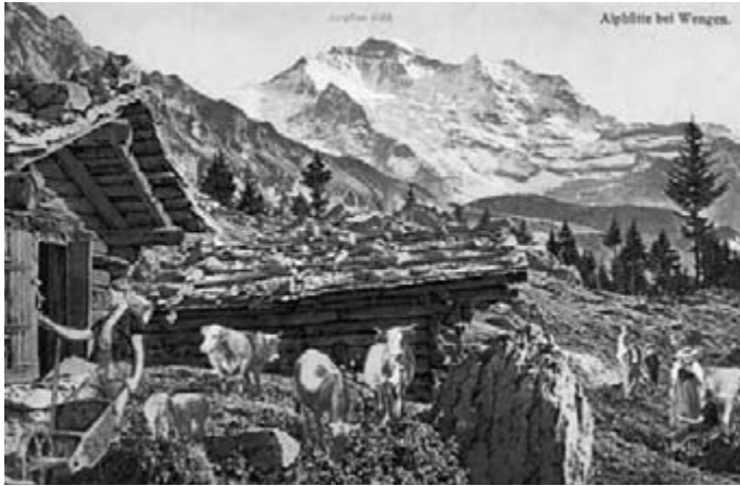
A postcard of Wengen in Switzerland, location of a Benjamin family holiday in 1911.