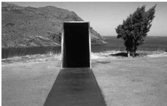
Dani Karavan's 1990–94 memorial Passages – Homage to Walter Benjamin in Port Bou.