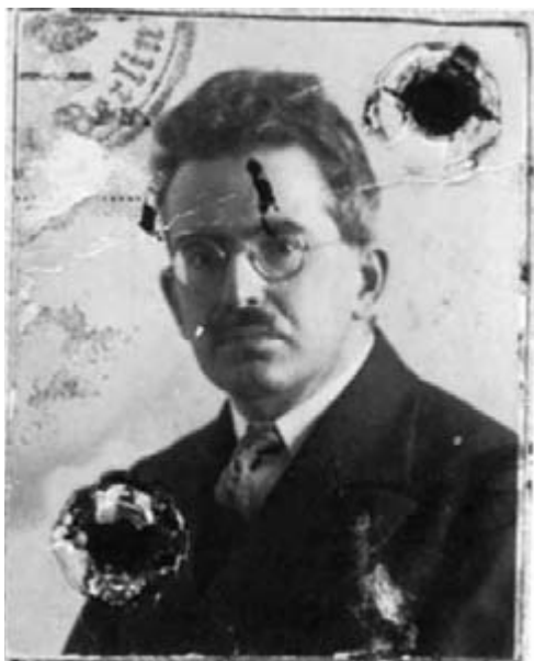
Walter Benjamin's passport photo- graph, undated.

of traces continues to grow, as documents turn up from private collections or from the dissolved Special Archive in Moscow. Since April 2004 12,000 pages have resided in the archive of the Academy of Arts in unified Berlin. Even ephemera entered posterity, against all odds. Walter Benjamin's remnants in reproduced form are likewise not hard to come by. The many editions of his writings, and the commentaries on them, abound with photographs and documents. An effect as slight as his address book from 1933–40 is available for purchase now, as perfect facsimile. 6