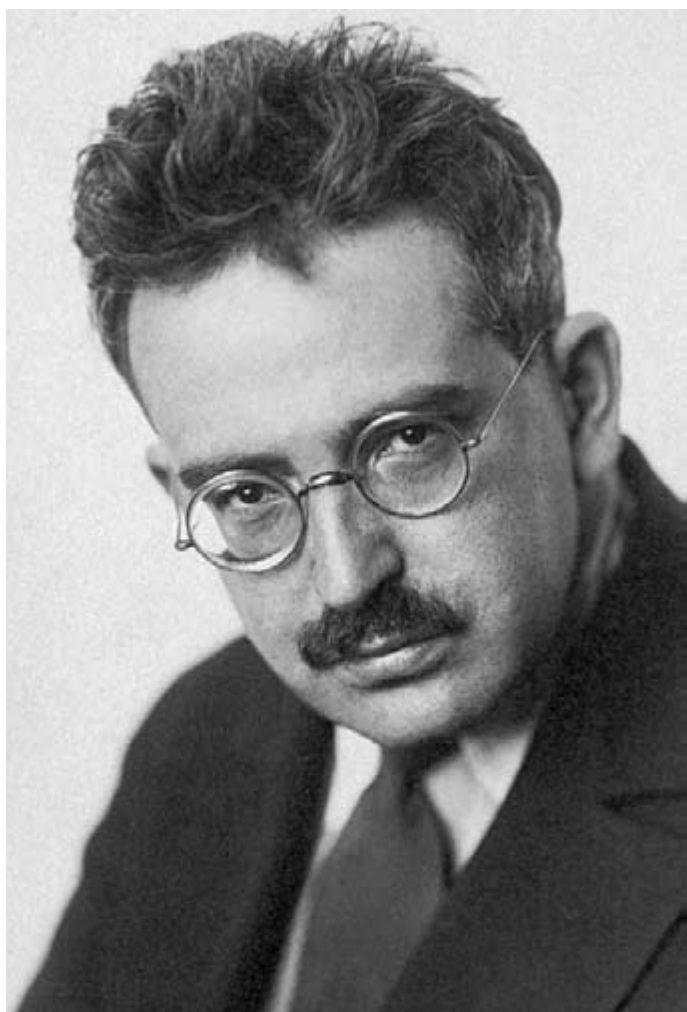
Walter Benjamin in his late thirties.