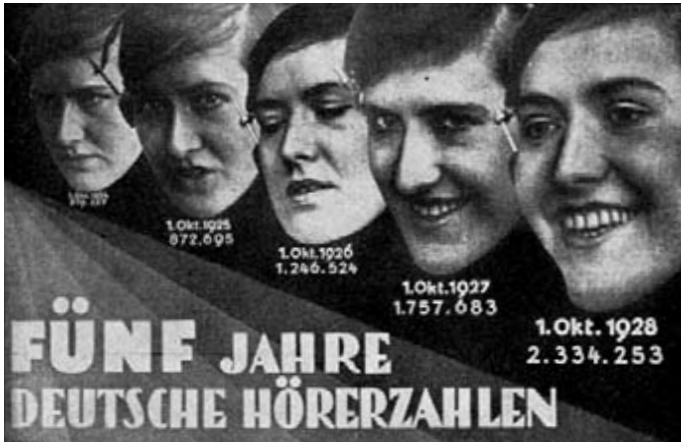
Five years of German radio listening figures; a poster reproduced in the 1929 German Radio Handbook .